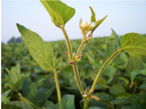
The ratings included on this page represent averages taken from field observations. Differences may occur due to environmental conditions and soil types. Please consult with an area specialist or extension agent before making your final seed purchase decisions.